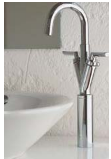
European faucets best complement the trend to European styling in today's bathrooms.

Being too original - Use neutral fixtures and materials and express your individual style in furniture and accessories.