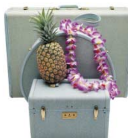
Before you pack your bags, take care of these details!

doors, and arrange for junk mail collection and snow removal.