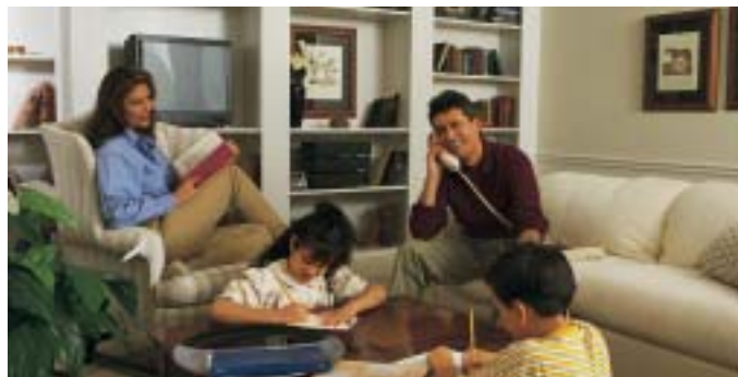
Turning unused space in the basement into a family room is one renovation that will add value to your home.

Home Theatre If you've been yearning for (continued on Page 2)