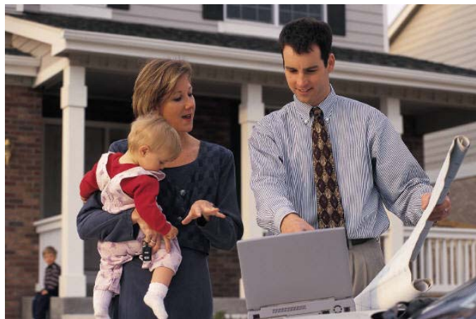
Contractors are hopping during a hot home renovation market. Homeowners are advised to get quotes now for winter and spring renovations.

Before you call in the pro for an estimate, you need to know the scope of your project and your budget. Once that is determined, get at least three estimates on your job. To ensure the quotes are comparable, give all contractors the same information and specify quality and type of materials.